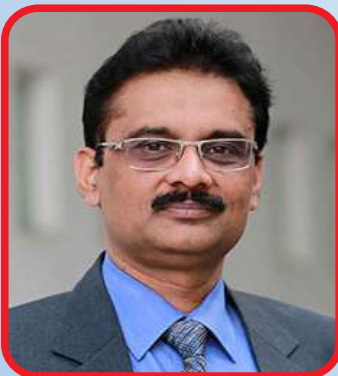
Dr. Ashok Kumar Mittal

Member, Rajya Sabha, Chief Patron, JAC Chancellor, Chandigarh University